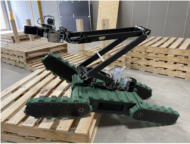
Fig. 1. Photo of the our robot, FUHGA3!!.

avoid unexpected results. We have been inspired with our previous robots and integrated our new ideas into the new robot FUHGA3.